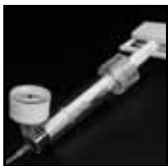
Endotek Analog Inflation Device 20ml, 30ATM