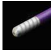
Brighton ® Bipolar Coagulation Probe