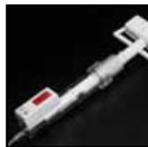
Endotek Digital Inflation Device 20ml, 30ATM