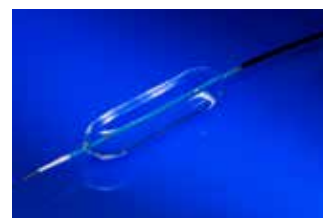
Wireguided Balloon Dilator

* smart number E= esophageal indication P= pyloric indication B= biliary indication C= colonic indication