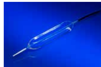
Fixed Wire Balloon Dilator