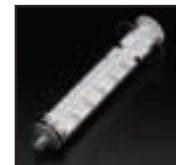
ENDOTEK Negative Pressure Syringe