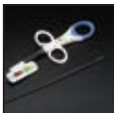
AEROSIZER™ Stent Sizing Device