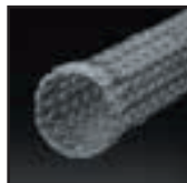
Fully Covered ALIMAXX-ES™ Esophageal Stent