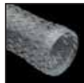
Fully Covered AERO™ Tracheobronchial Stent