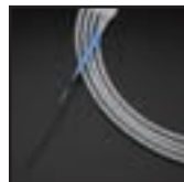
MAXXWIRE™ Guide Wire