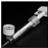
Endotek Analog Inflation Device 20ml, 30ATM