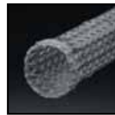
Fully Covered ALIMAXX-ES ™ Esophageal Stent