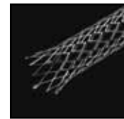
ALIMAXX-B ® Biliary Stent