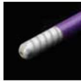
Brighton ® Bipolar Coagulation Probe