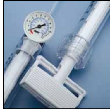
ENDOTEK BIG60 INFLATION DEVICE 60ml Inflation Device with Angled Gauge

Merit Endotek's BIG60 Inflation Device is designed to inflate and deflate non-vascular balloon dilators while accurately monitoring and displaying crucial inflation pressures. Our ergonomically designed 60ml inflation device is a one-piece, easy-to-use device that pairs Merit's market-leading inflation device experience with our non-vascular stent technology.