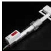
Endotek Digital Inflation Device 20ml, 30ATM